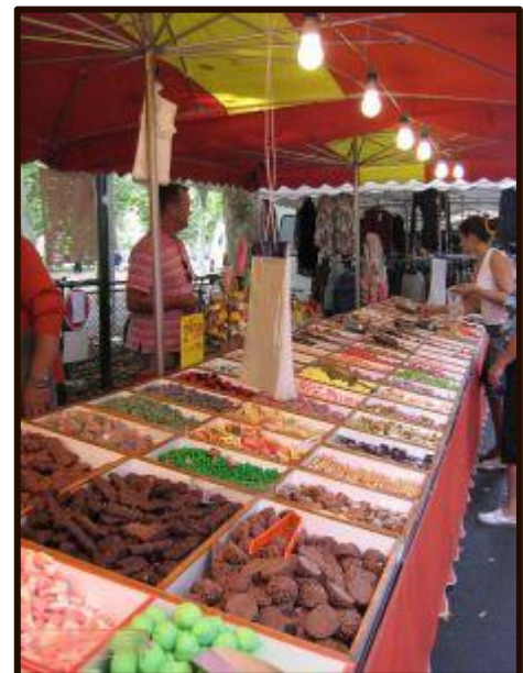
Take a wonder around to the various markets in the area.

29 to 31 Echuca–Moama Winter Blues Festival