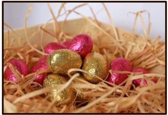
Enjoy the Easter festival.

Barmah Muster. Action will include Barmah Forrest yarn spinning competition and camp oven tea, country rock concert and horse and novelty events.