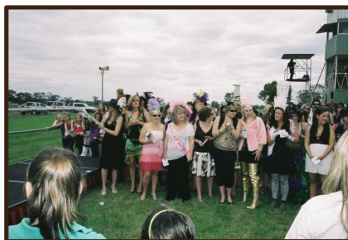
Echuca Harness Racing

From all the staff at Echuca Holiday Park we hope you enjoy your stay with us.