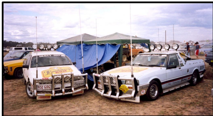
Deniliquin Ute Muster

Run by the One and All Campaspe Inclusion Project, the day will be held at Echuca Racecourse.